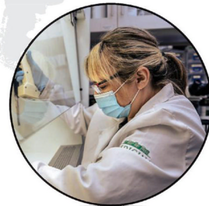
Scientists at a training session at Abbott's U.S. labs (left), and a researcher at the University of São Paulo (right)

for the next potentially dangerous bugs. In June, as monkeypox began infecting people around the world, the network monitored genetic sequences of the virus that showed it had come from the less virulent of two strains endemic in Africa, and that existing vaccines would continue to be effective. Using that data, Abbott has developed a monkeypox PCR test (for research purposes only) that coalition members are using to track the virus, contain its spread, and detect any changes in the viral genome as soon as they appear. APDC is also continuing to monitor other emerging infectious diseases, including hepatitis, Zika, dengue, meningitis, and yellow fever. As humans continue to encroach on previously wild geographical regions, we're more likely to come into contact with pathogens that can pose a threat to health. Climate change is also