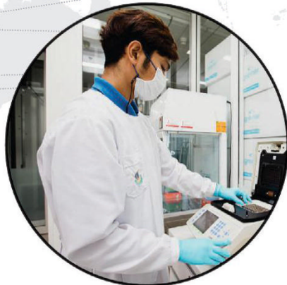
Researchers at University of KwaZulu-Natal (left) and Siriraj Hospital, Mahidol University (right)

mutations that make it easier for the virus to spread or cause more serious disease.